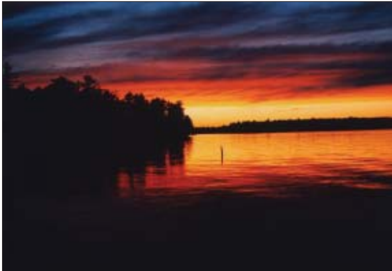
Stephen W. Joy. Sunset . Photograph. Northwood Lake, New Hampshire.

An updated algorithm for management of myelodysplastic syndromes incorporates newer effective treatment options.