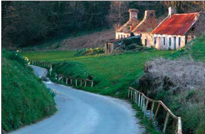
Jacky Tiplady. Jersey Cottages. Photograph.

The role of low-molecular-weight heparin in cancer patients with acute venous thromboembolism and how it improves outcomes are discussed.