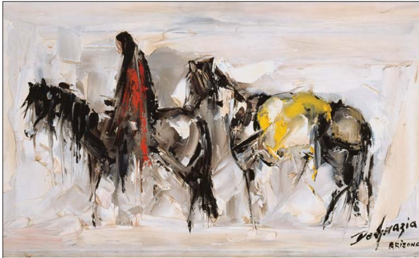
Ettore "Ted" DeGrazia. Alone . Oil on canvas, 10" × 18". Courtesy of DeGrazia Foundation.

The association between comorbidity and the risk and prognosis of cancer is reviewed.