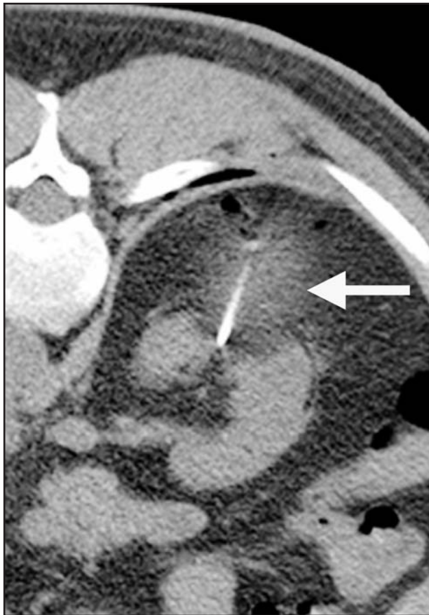
Fig 2. — Percutaneous cryoablation of a renal mass under CT guidance. Note the hypodense ice ball formed at the site of the renal mass.

Percutaneous cryoablation represents the least invasive method of cryoablation. Typically, percutaneous cryotherapy is reserved for small posterior lesions that are reachable by an unimpeded tract from the skin sur-