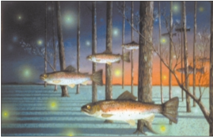
Steve R. Garner. Trout in the Trees Series #7 . Watercolor, 27" × 35".

Preoperative endocrine therapy is well tolerated in older patients and can increase the rate of breast-conserving surgery.