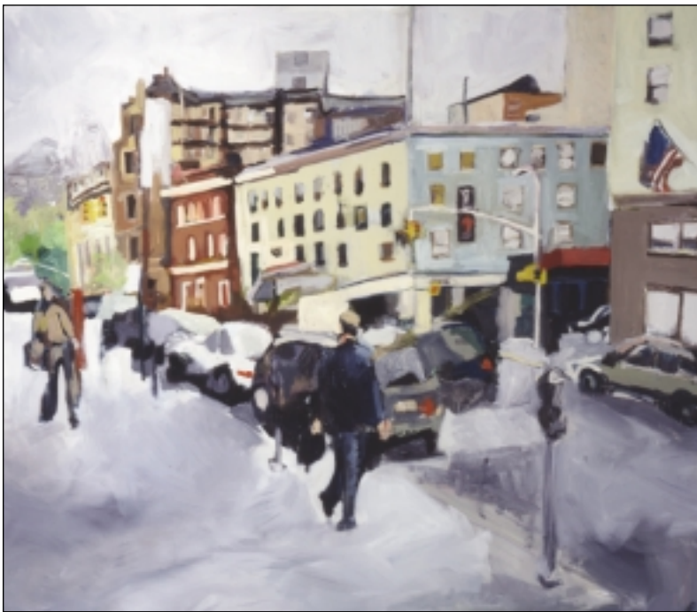
Jennifer Eisenpresser. Intersection . Oil on canvas, 50" × 54".

Gene therapy of melanoma using currently available gene transfer approaches is feasible and safe.